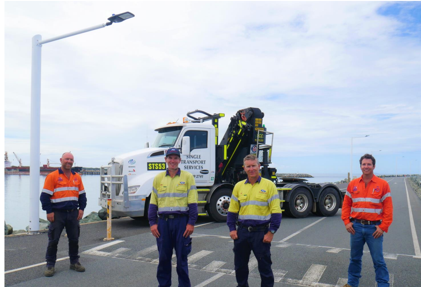
New streetlights were installed on the Southern Breakwater by local contractors Revolution Electrical in March 2021.