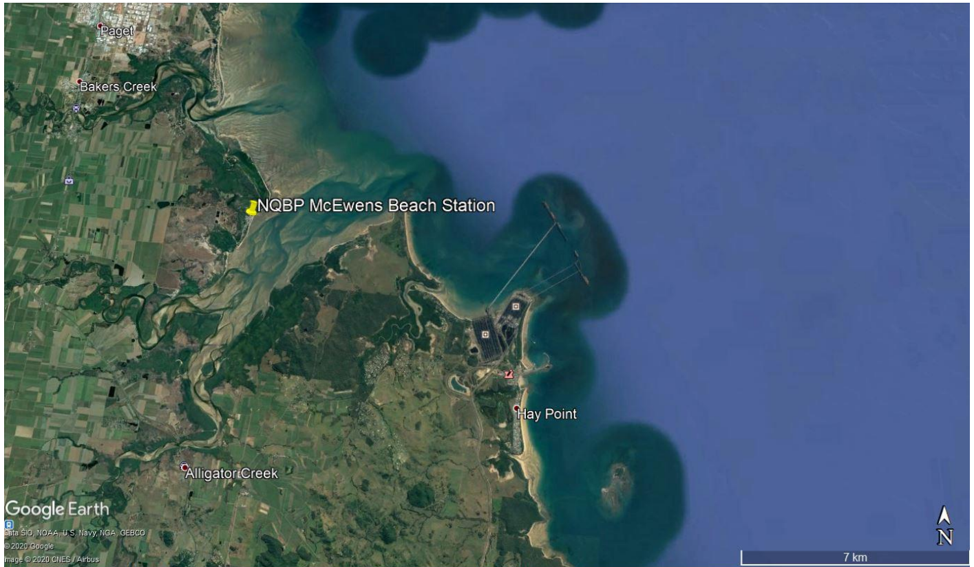
Figure 1: McEwens Beach Monitoring Station Location