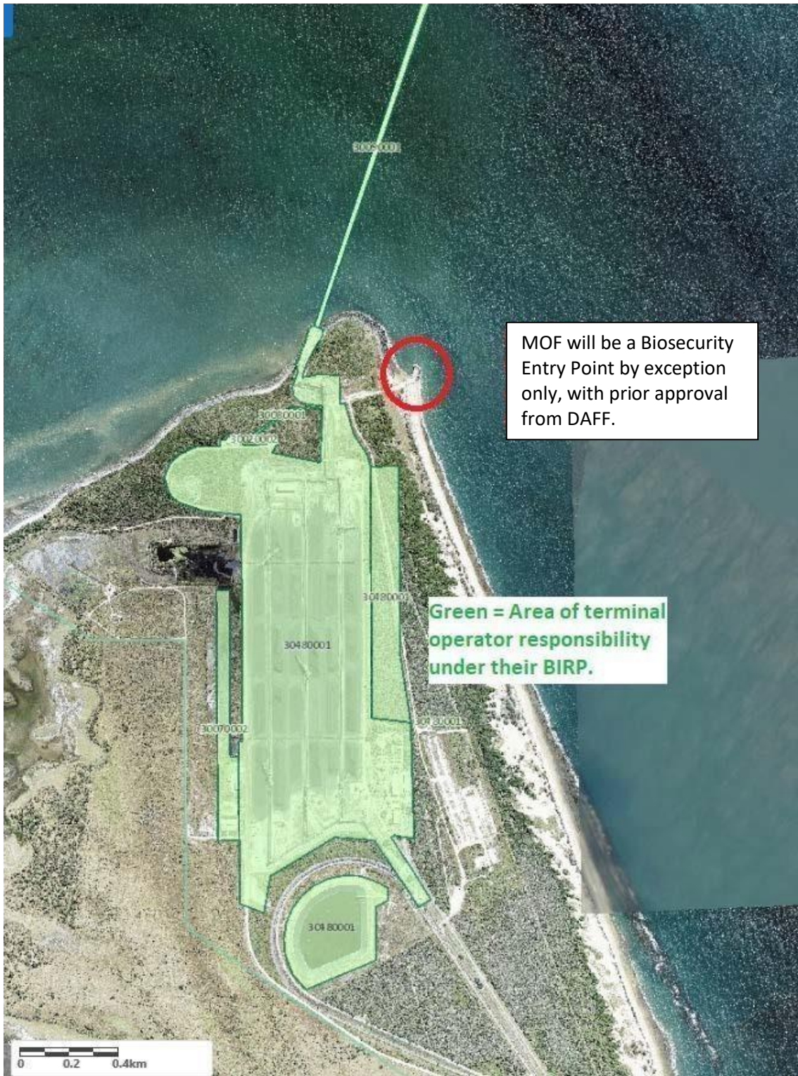
Figure 2: Terminal area and NQBP MOF area