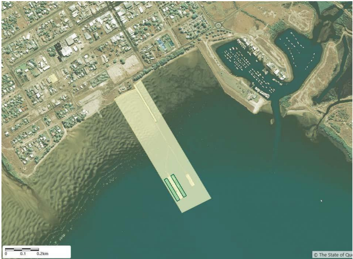
Figure 3: Bowen Jetty area (not a Biosecurity Entry Point)

Note: Bowen Jetty is included in this BMP for context only , and it is not a BEP for the Port of Bowen (Abbot Point). It is a Non-First Point of Entry and permission must be given by DAFF before an international vessel can arrive at this location.