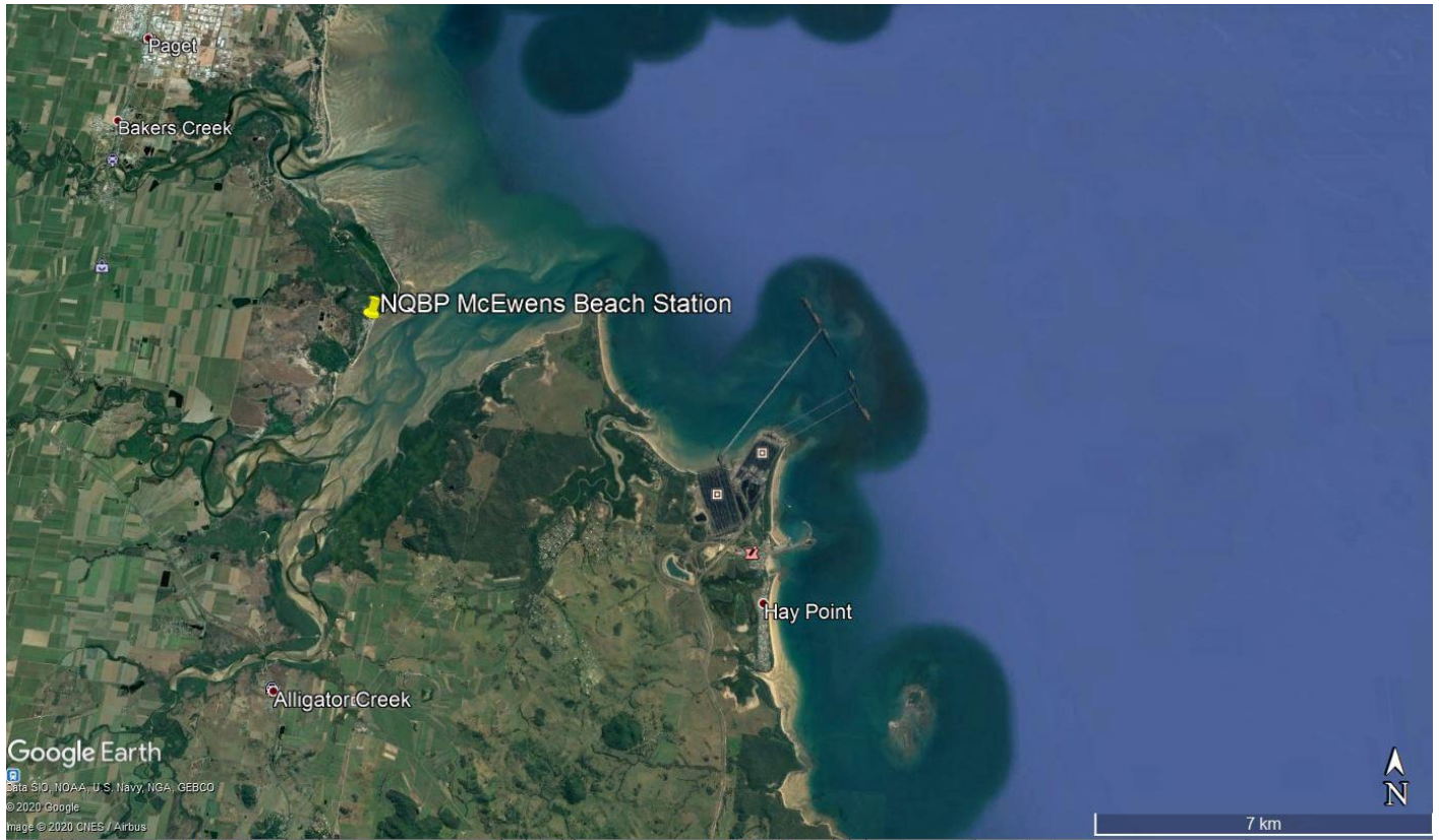
Figure 1: McEwens Beach Monitoring Station's Location