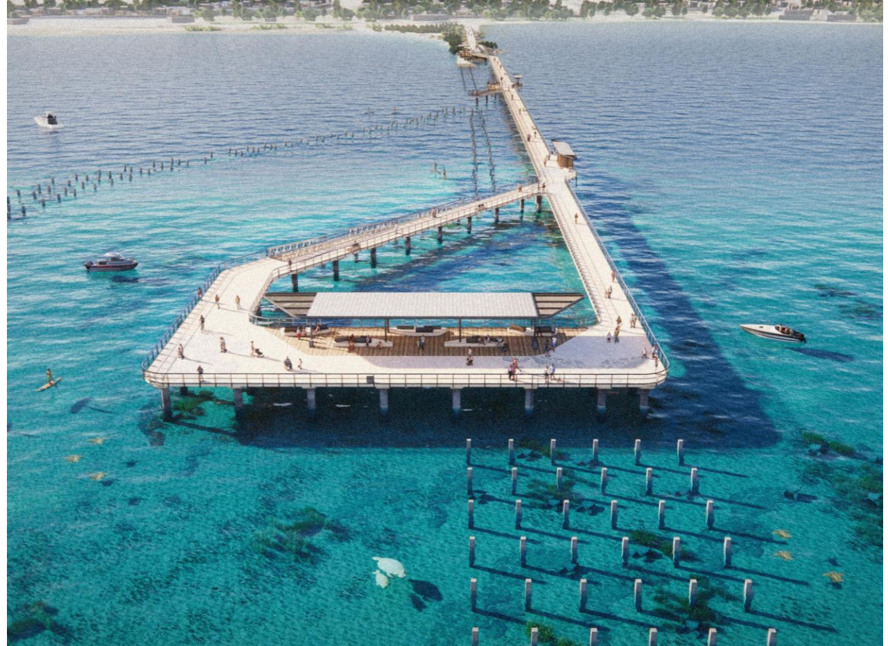
Bowen Jetty concept