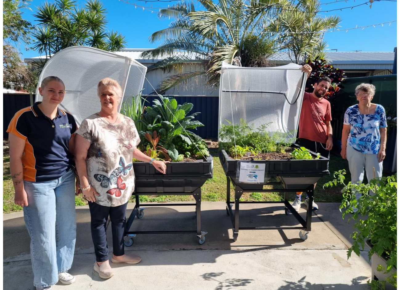
2024-25 Community Fund Recipient Bowen Flexi Care – Digging to Dining project